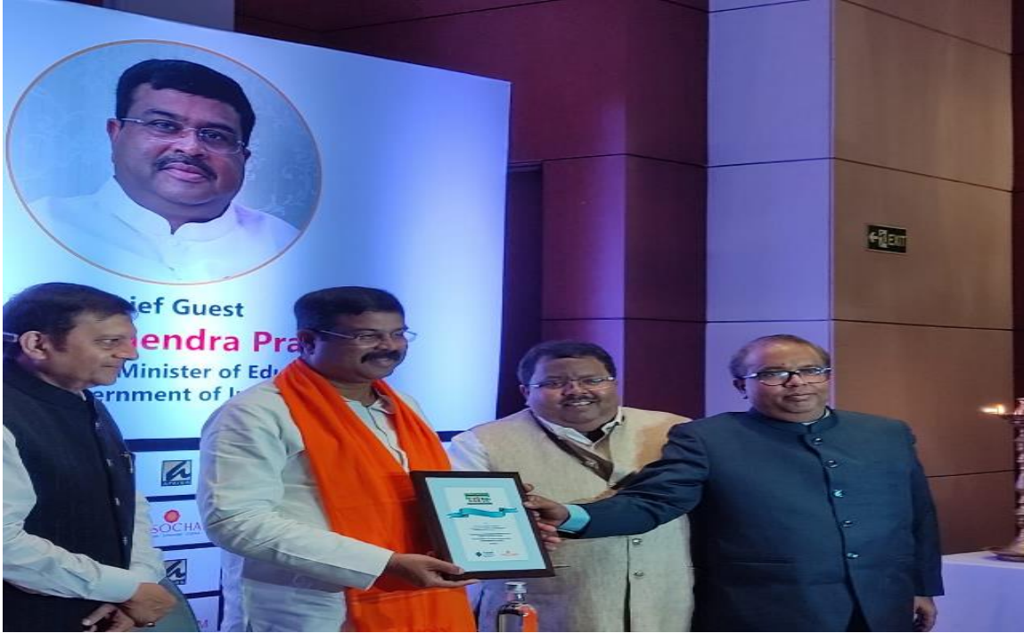
Chief Guest Shri. Dharmendra Pradhan, Hon'ble Education Minister, Govt. of India