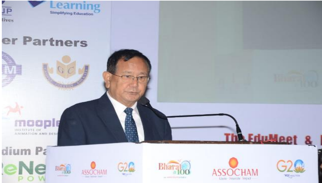
Chief Guest: Dr. Rajkumar Ranjan Singh, Hon'ble Minister of State for Education & External Affairs, Govt. of India